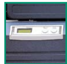
Simple to understand LCD Control Panel with display information