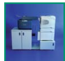
Optional Tray Cabinet System which allows for different printer configurations

Please contact us for further information on the Mailfinisher 4000, or to arrange a no obligation demonstration.