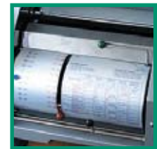
Hi-Tech fold drum unit allows simple adjustment for different folds